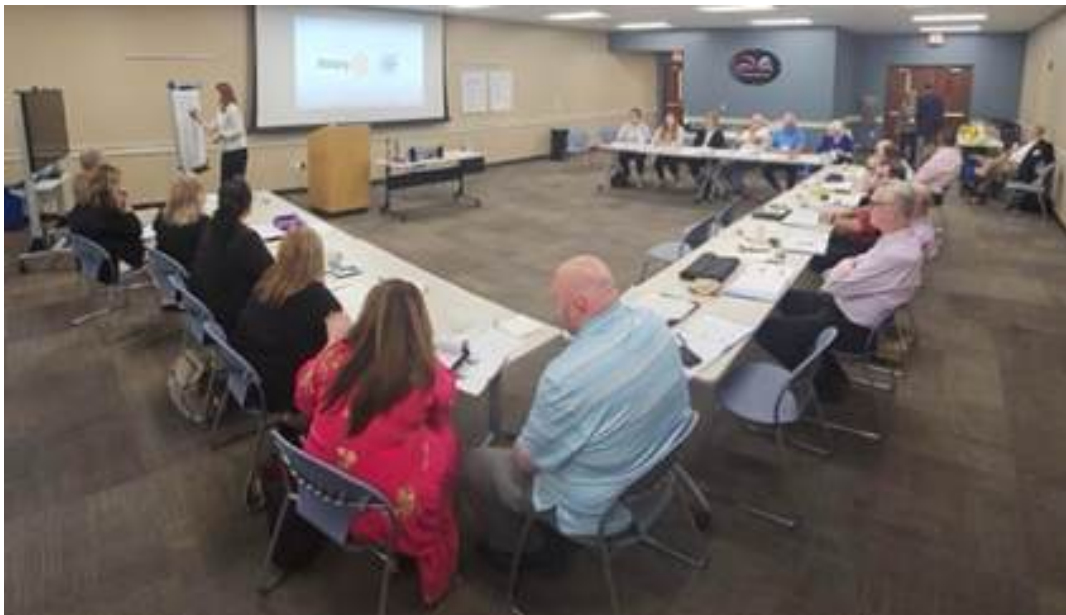
RLI participants in main classroom and breakout sessions