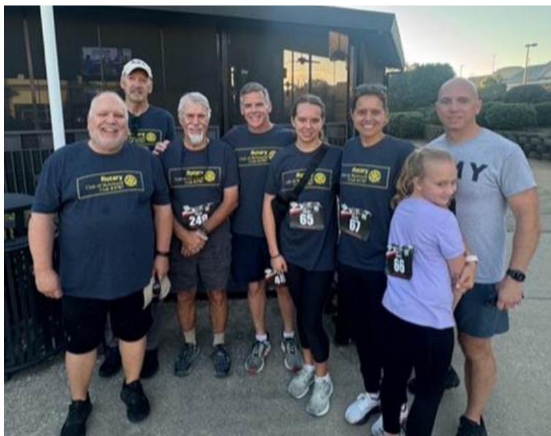
The Richmond Club sponsored the Tracks for Packs 5K with a sponsorship and 14 runners/walkers. The event supports a food backpack program for local school children to fight food insecurity. Great time and a great event.