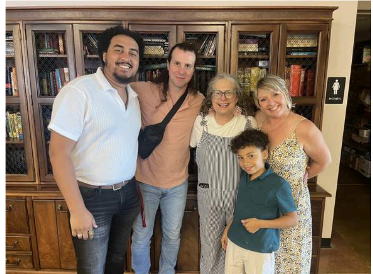
Mountain Movers Theatre Company

Joining members at the Louisa Rotary Club for the June 27 meeting was the cast from the upcoming production of "Tarzan" presented by the Mountain Movers Theatre Company. They explained the play and introduced each of their characters. Opening day will be July 5 and will run through July 14. Please contact the Mountain Movers Theatre Company for the exact days and times of the performances. (Pictured are the cast and crew for upcoming "Tarzan" production.)