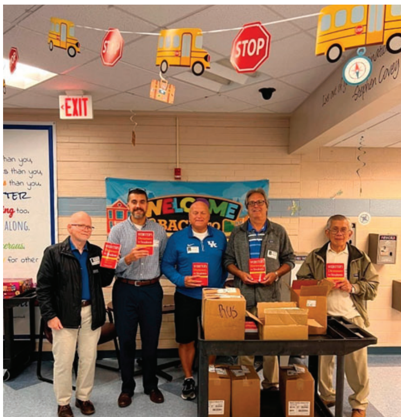
Members of the Russell Rotary Club presented Dictionaries to the 3rd Graders at Russell-McDowell School.