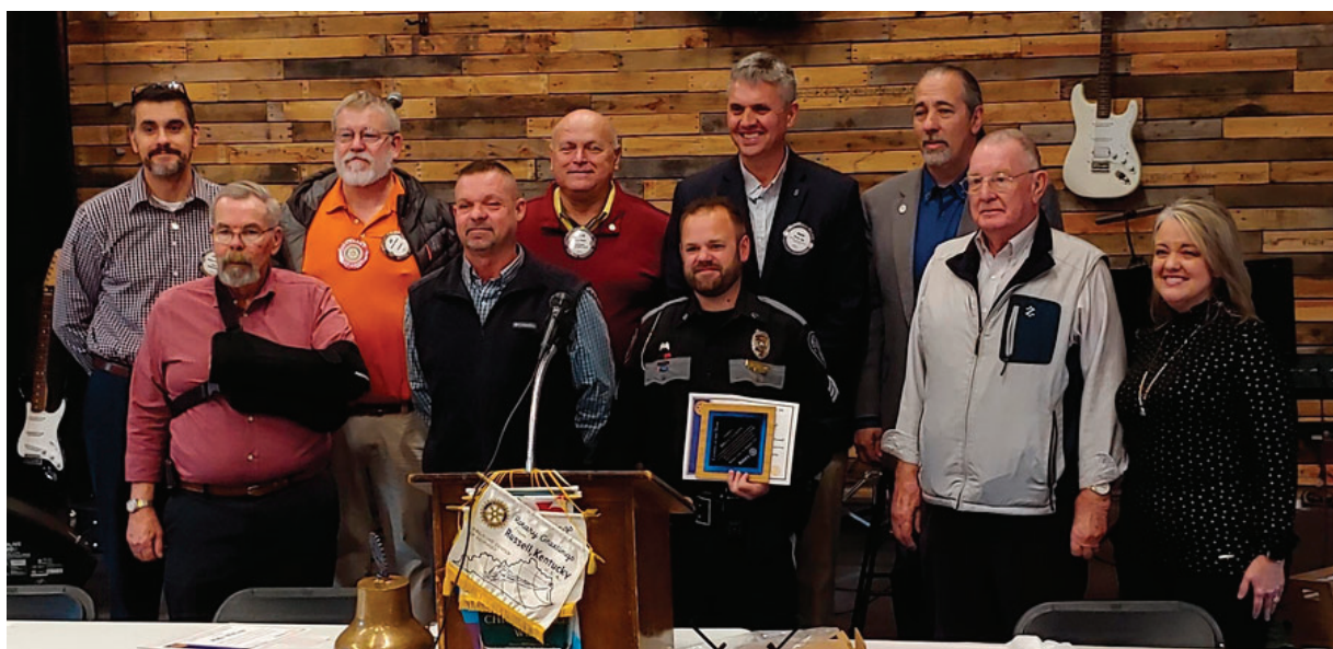
Nominees with the Club Board